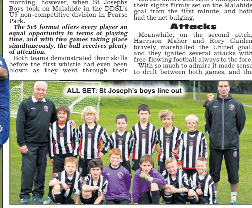
ALL SET: St Joseph's boys line out