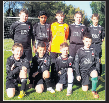
St Pat's Ath 3 Sacred Heart 10 DDSL U-12 B1